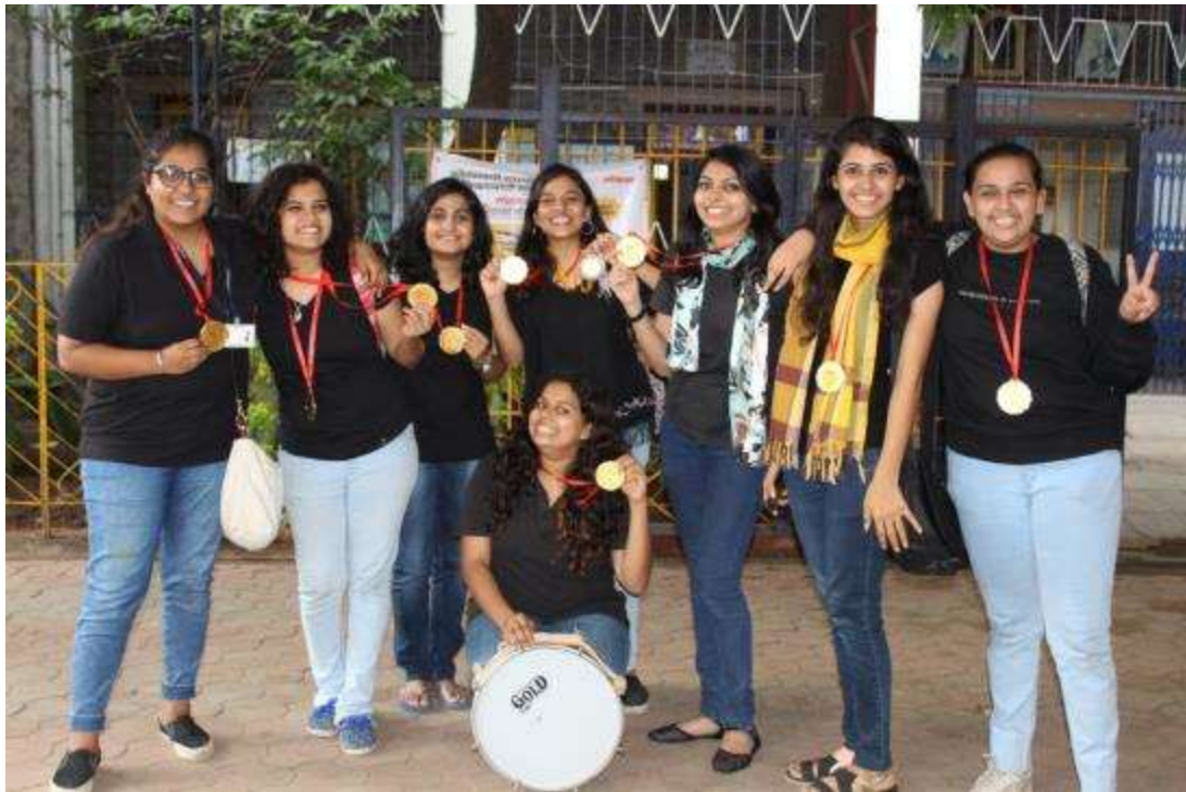
1 ST position in GROUP SINGING competition