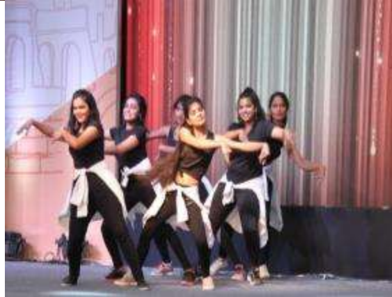
GROUP DANCE- SOFT- GIRLS