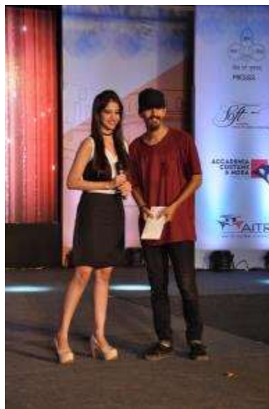
SOLO DANCE- WINNER