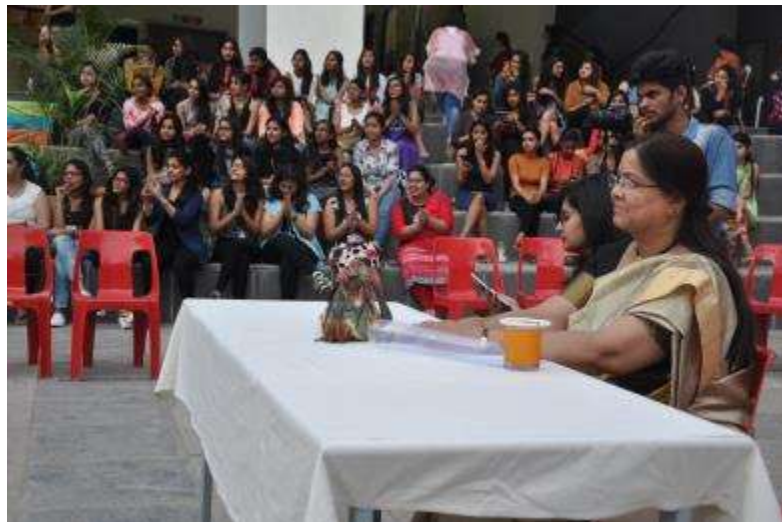
JURY- ENJOYING THE PERFORMANCE