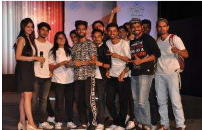
GROUP DANCE – WINNERS